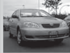
2005 Toyota Corolla