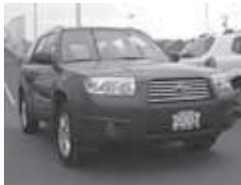
2007 Subaru Forester

WE HAVE TOO MANY USED CARS The "INSULT THE USED MANAGER" SALE!