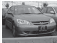
2005 Honda Civic