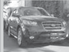
Used Santa Fe's