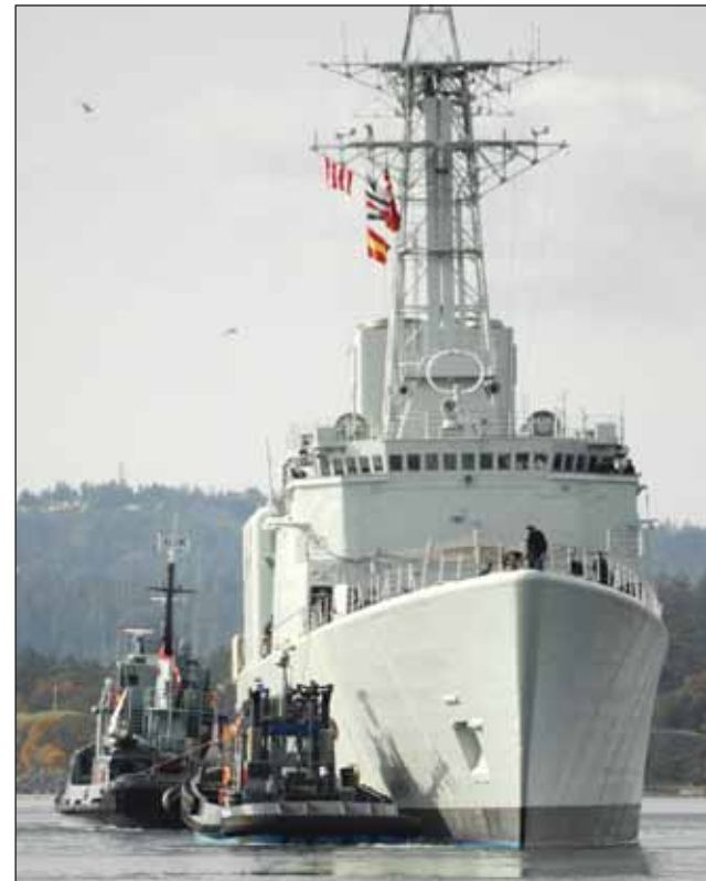
Shelley Lipke, Lookout

The crew and officers aboard Algonquin are ramping up for the ship's return.