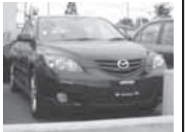
2006 Mazda 5