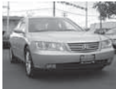
2006 Hyundai Azera

STK # 9G-5473A WAS $24,999 / NOW $19,995