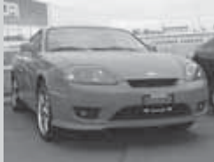
2006 Hyundai Tiburon

STK # 8T-9216A WAS $19,999 / NOW $15,999