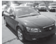
2006 Hyundai Sonata

STK # 9G-5473A WAS $24,999 / NOW $19,995