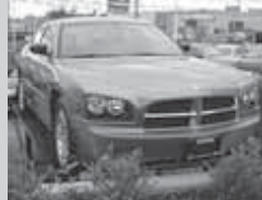
2006 Dodge Charger

STK # 8T-9216A WAS $19,999 / NOW $15,999