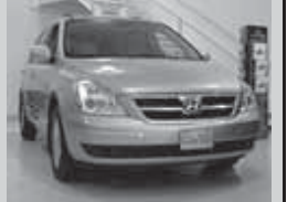
All New Entourage Vans