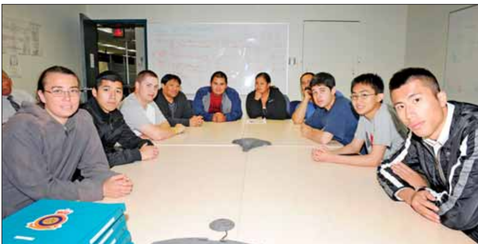
Ten candidates will spend nine weeks learning about all the trades Fleet Maintenance Facility Cape Breton has to offer.