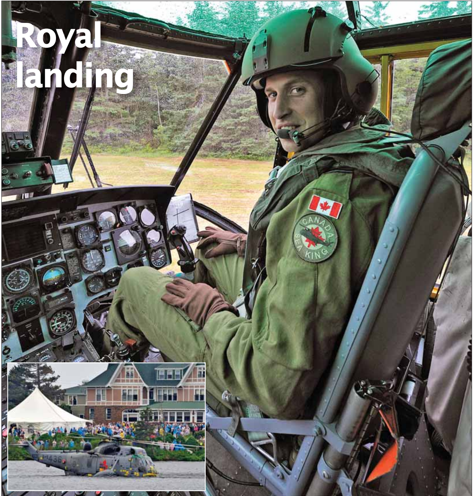
Cpl Rick Ayer, Formation Imaging Services, Halifax Prince William, The Duke of Cambridge, sits in the cockpit of a CH-124 Sea King prior to takeoff from Dalvay by the Sea, Prince Edward Island, during a Waterbird Emergency Landing Procedure training exercise on Dalvay Lake. See more photos from the Royal visit on page 6.

Editorial & Opinion..... 4 Classifieds..... 18-19