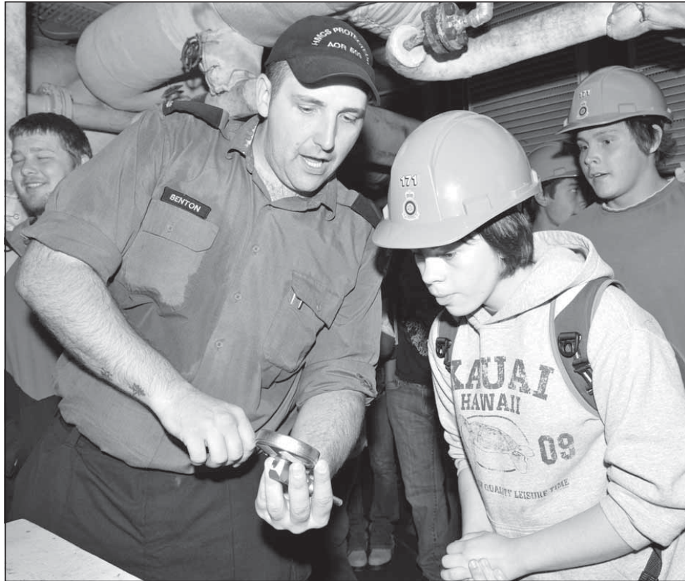
This year's group of 10 Employment Equity Trades Orientation Program (EETOP) students toured HMCS Protecteur.