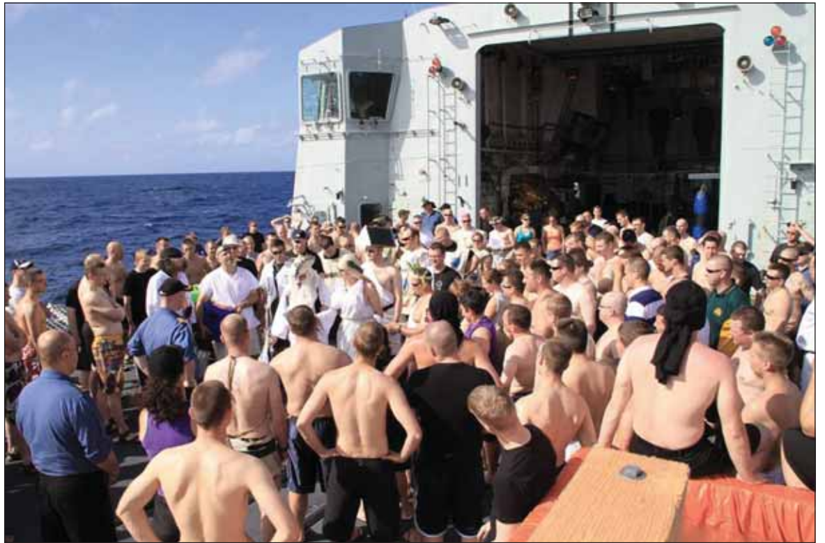
With the Tadpoles mustered on the flight deck, the Captain awaits the arrival of King Neptune's Court.

"Make way for his most glorious Oceanic Majesty Neptune Rex, ruler of all who sail upon the sea!" announced a herald, as the crowd parted to greet the royal visitors.