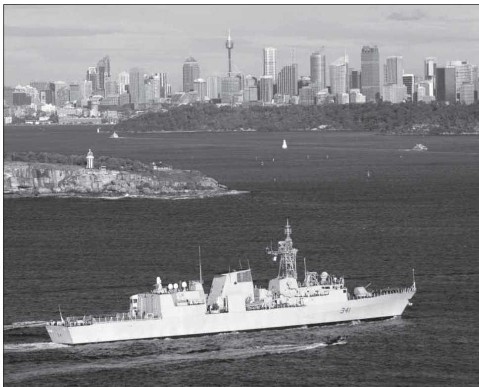
HMCS Ottawa arrives in Sydney, Australia, Harbour on July 4.

1192 Fort 250-381-2151 | On peut vous aider en français | 813 Goldstream 250-478-1731