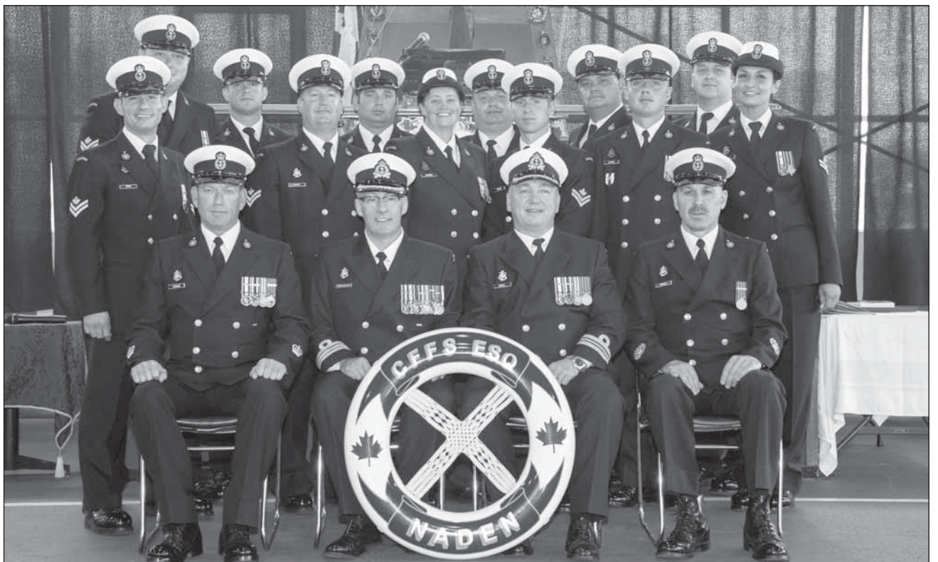
Students of Boatswain QL6A Class 0024 pose with CFFS(E) staff during graduation ceremonies on June 29.