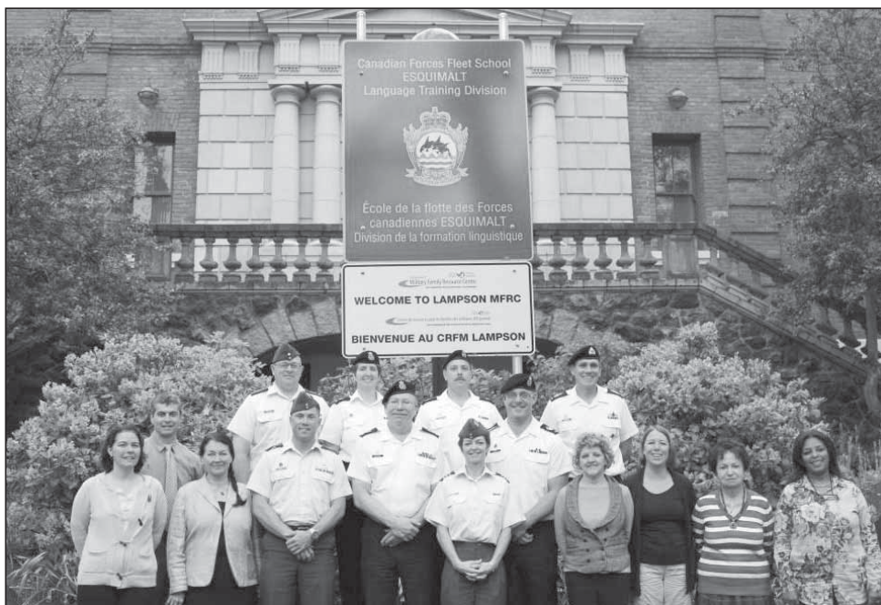
The last continuous french class to graduate from the Lampson St. location pose in front of the heritage building. The Language Training Division marked the move to a new location at Work Point August 31.

tage of all the excellent amenities offered by the Base. We look forward to continued success in assisting our students achieve their second language training goals."