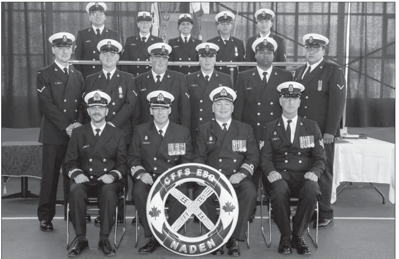
Students of Boatswain QL5 Class 0042 pose with CFFS(E) staff during graduation ceremonies on June 29.