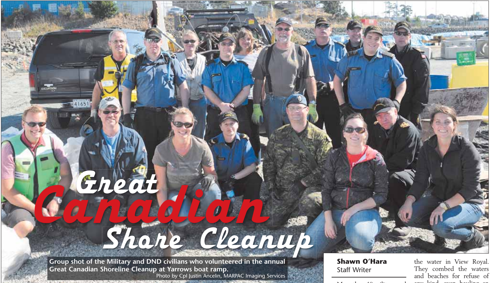
Group shot of the Military and DND civilians who volunteered in the annual Great Canadian Shoreline Cleanup at Yarrows boat ramp.