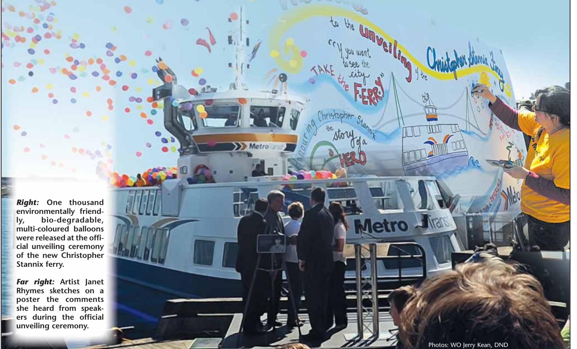
Right: One thousand environmentally friendly, bio-degradable, multi-coloured balloons were released at the official unveiling ceremony of the new Christopher Stannix ferry.