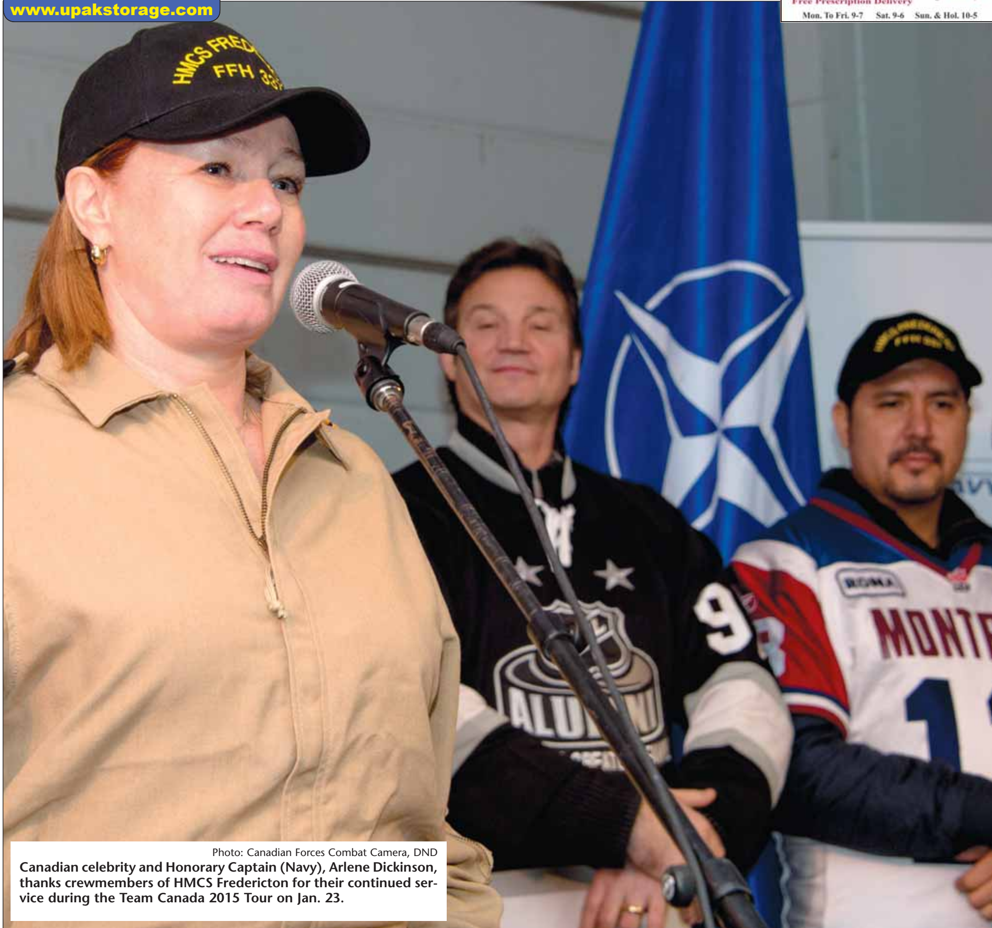
Canadian celebrity and Honorary Captain (Navy), Arlene Dickinson, thanks crewmembers of HMCS Fredericton for their continued service during the Team Canada 2015 Tour on Jan. 23.