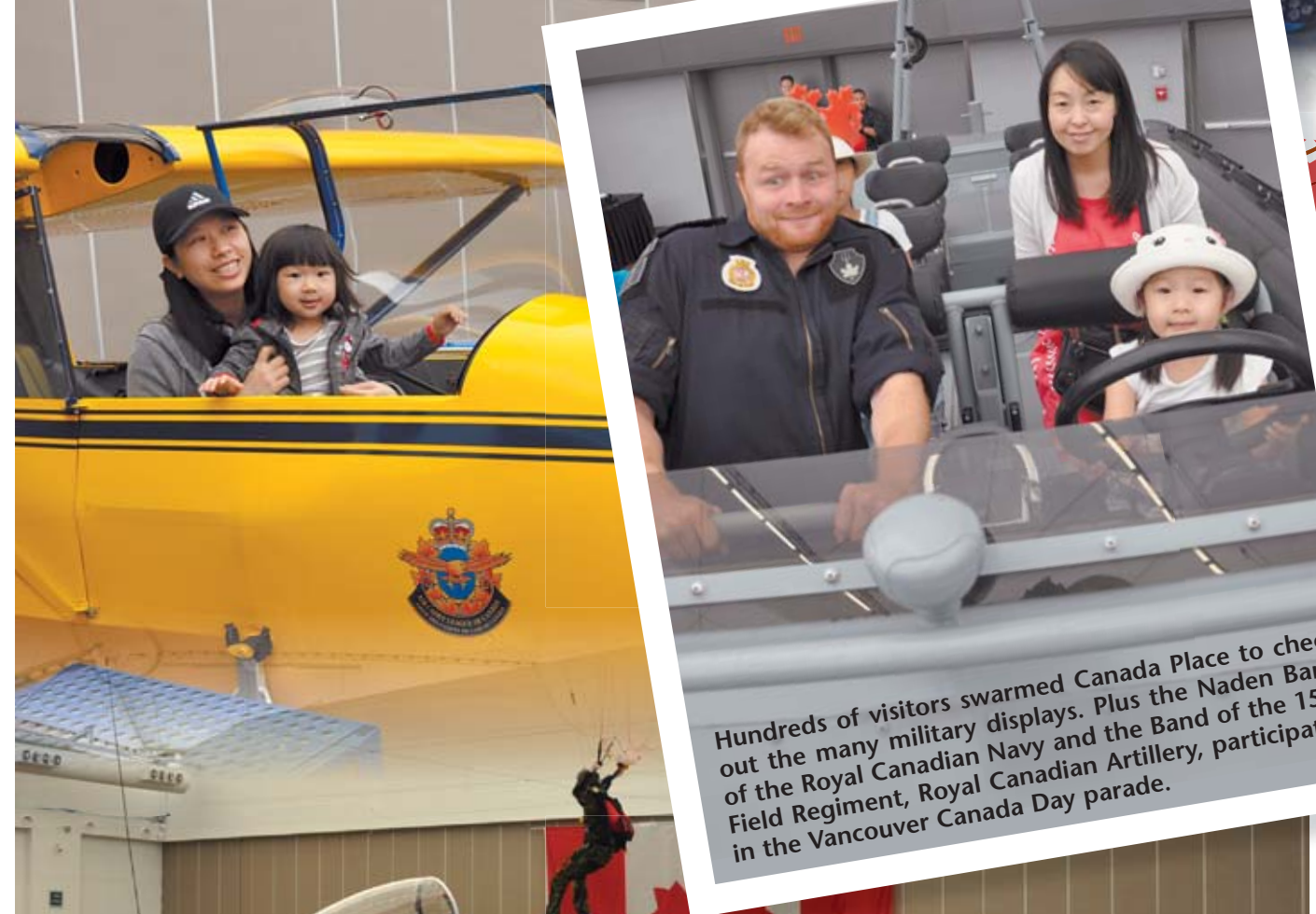
Hundreds of visitors swarmed Canada Place to check out the many military displays. Plus the Naden Band of the Royal Canadian Navy and the Band of the 15th Field Regiment, Royal Canadian Artillery, participated in the Vancouver Canada Day parade.

HMCS Regina welcomed over 100 members of the Chinese and Sri-Lankan community on board July 3 as part of Canada 150. RAdm Art McDonald and HCapt(N) Chan greeted visitors and spoke about the importance of inclusivity and diversity in the Canadian Armed Forces. The visit to Regina included tours of the ship. The community members also sat for a briefing that highlighted the navy's activities in Indo-Asia Pacific and efforts in diversifying its workforce to be more inclusive.