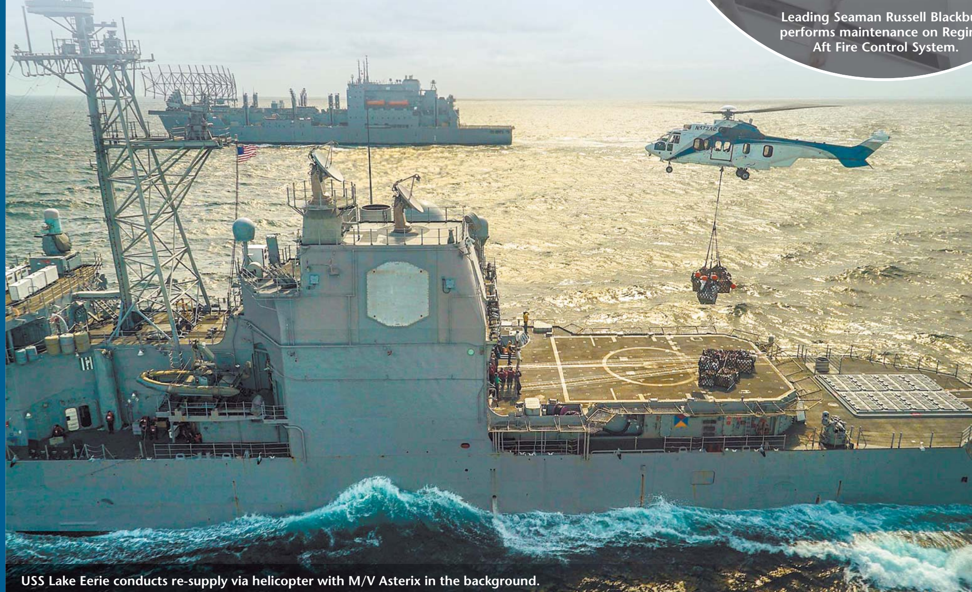
USS Lake Erie conducts re-supply via helicopter with M/V Asterix in the background.