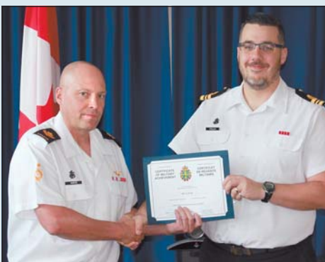
MS Hunter receives a Certificate of Completion.