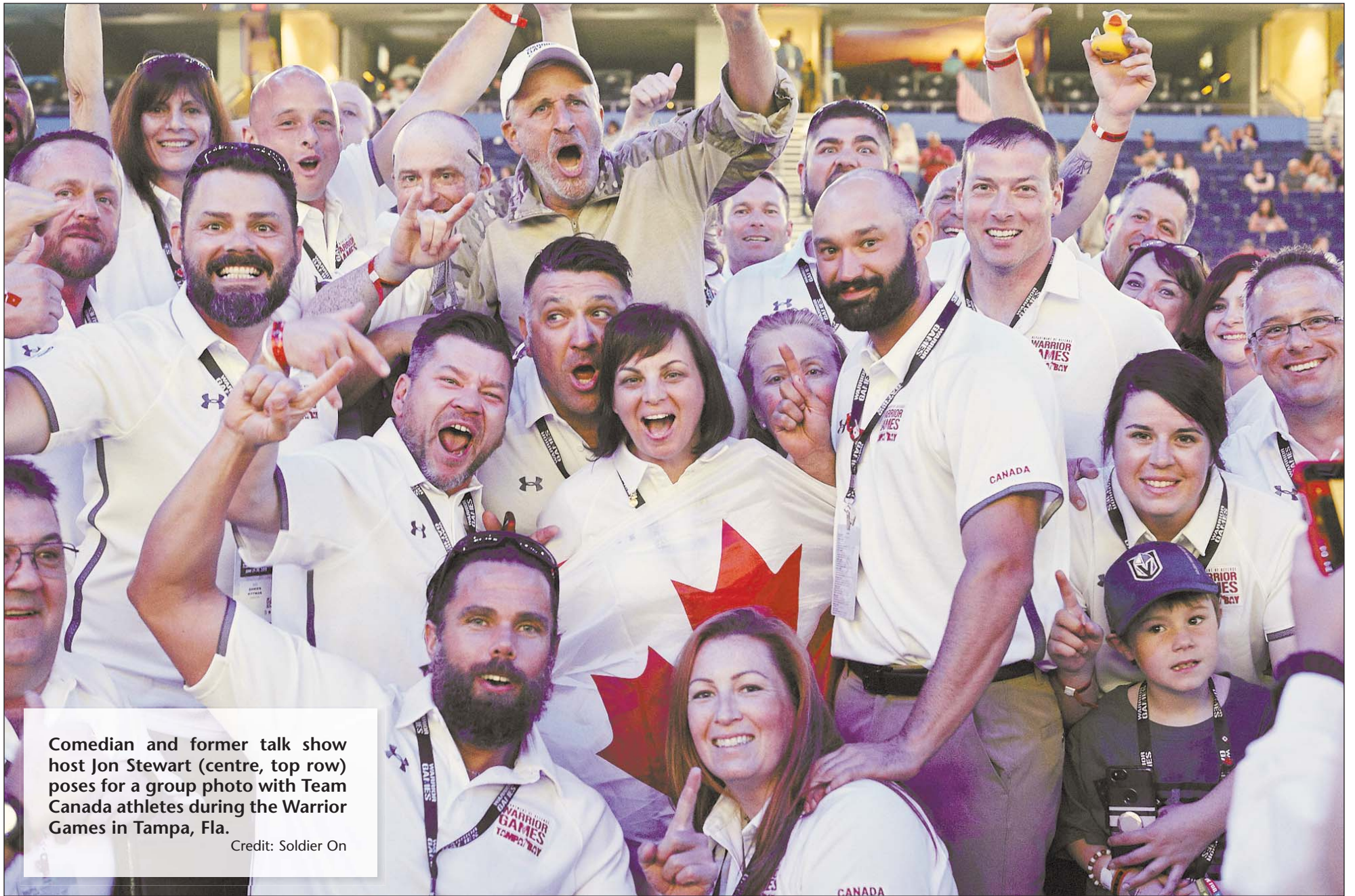
Comedian and former talk show host Jon Stewart (centre, top row) poses for a group photo with Team Canada athletes during the Warrior Games in Tampa, Fla.