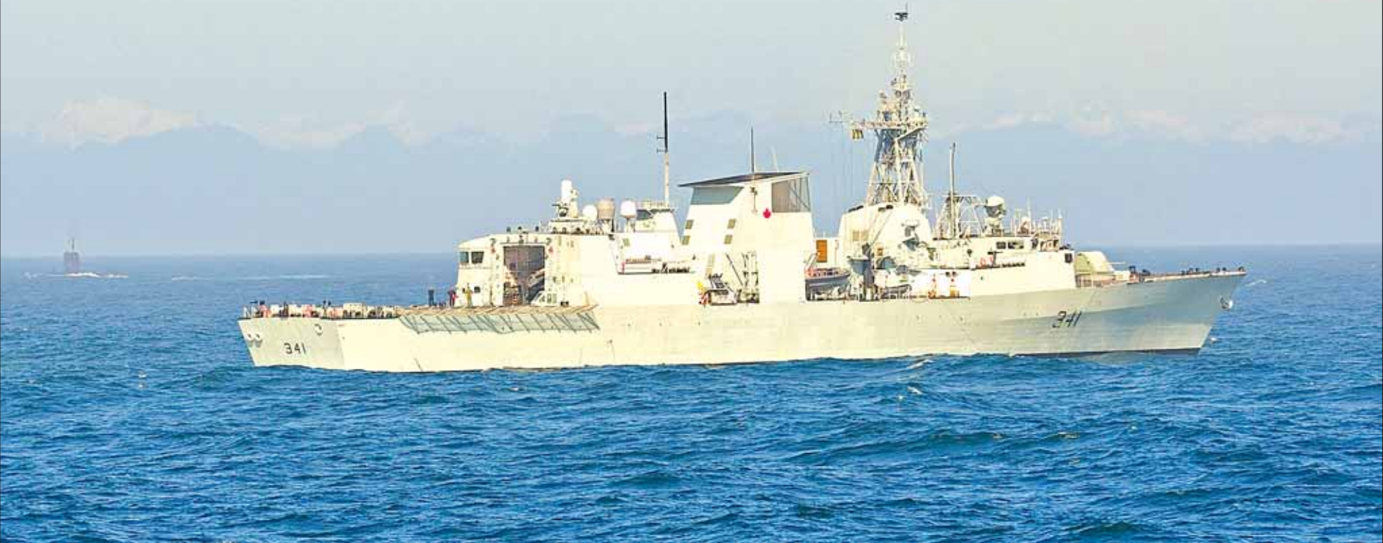
HMCS Ottawa passes by HMCS Victoria during maritime manoeuvre practice.