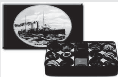
Rainbow Tin of luxury Rogers' Chocolate truffles