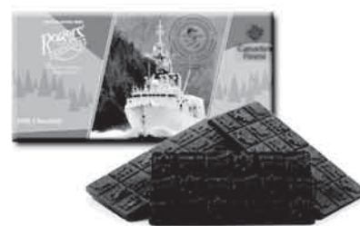
Rogers' Chocolate milk or dark chocolate bars