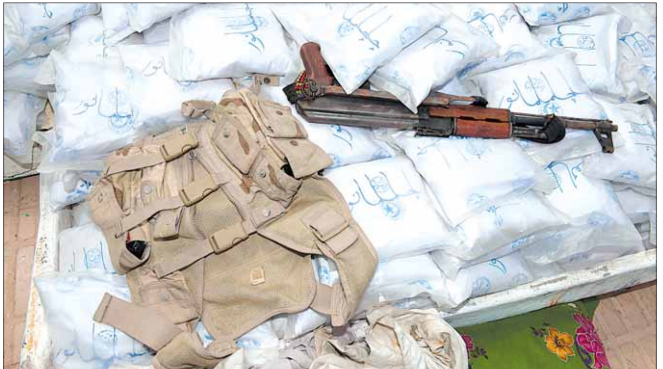
Cpl Malcolm Byers, HMCS Toronto

Narcotics are piled high awaiting transport to HMCS Toronto during a narcotics seizure in the Indian Ocean.