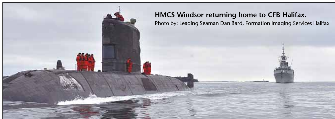
HMCS Windsor returning home to CFB Halifax.

In the future, RCN strategic global engagement, through the concept of Generate Forward, will continue to expand and leverage the production of mission-ready forces while facilitating Canada's diplomatic relations and regional partnerships in support of higher GoC strategic intent. And while deployments such as Windsor's can change on a dime, others are planned. HMC Ships Ottawa and Winnipeg will be conducting an Indo-Asia-Pacific deployment in 2017 employing the Generate Forward concept with anticipated engagements in numerous locations.