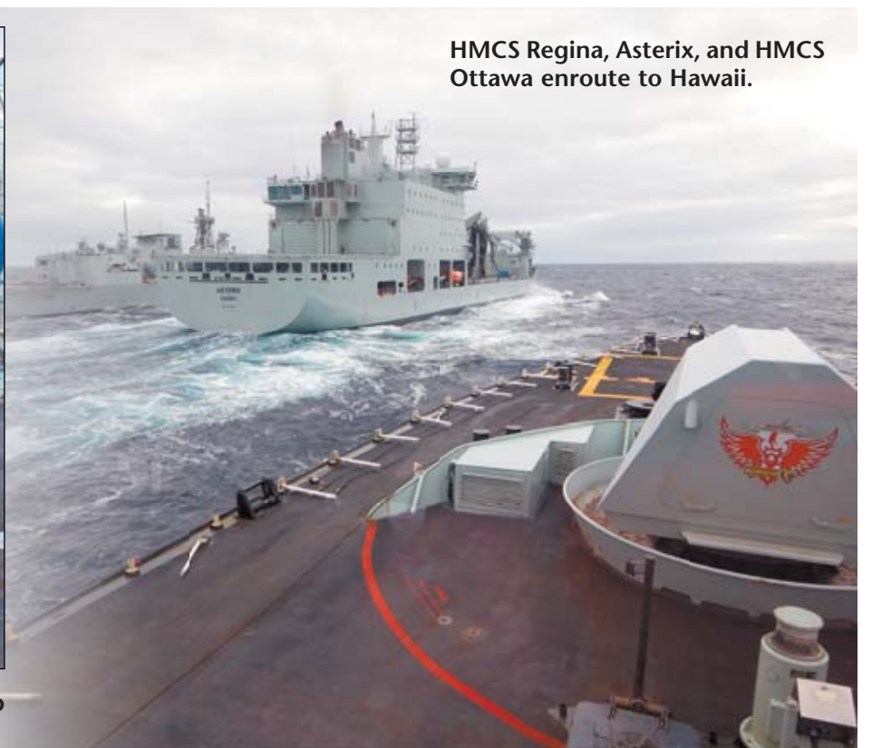
HMCS Regina , Asterix, and HMCS Ottawa enroute to Hawaii.