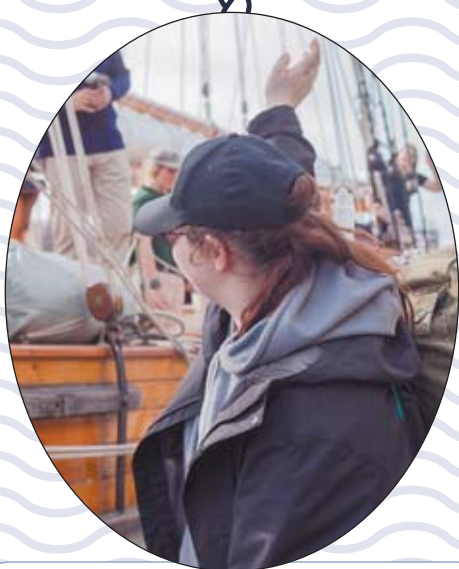
A cadet trainee waves goodbye to her instructors after returning from her five-day journey aboard Pacific Swift, March 11 to 15.