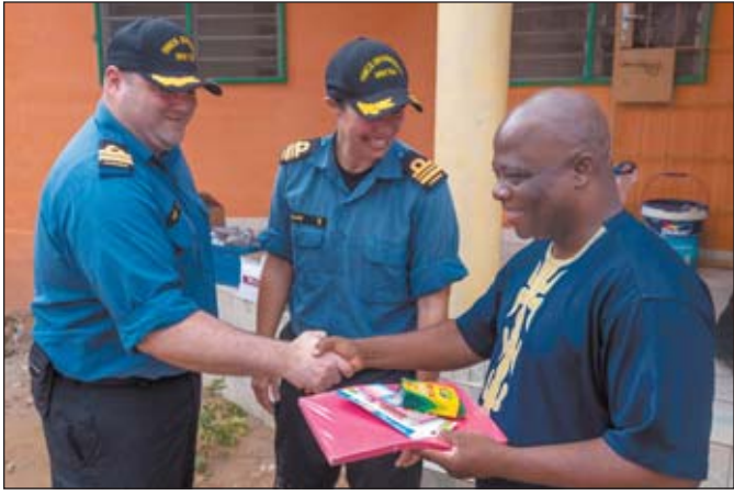
Top left: The Commanding Officers of HMC Ships Shawinigan and Kingston present donated school supplies to the director of L'Espace de Fraternité in Lomé, Togo.