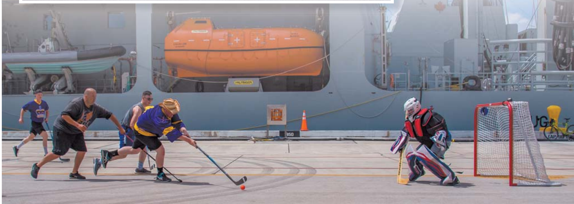
Members of the HMCS Regina and NRU Asterix's crews play a game of ball hockey during some down time at Naval Base Guam during Operation Projection on March 7.