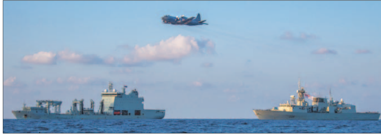
A CP-140 Aurora, NRU Asterix and HMCS Regina are part of Canadian Task Force 150.