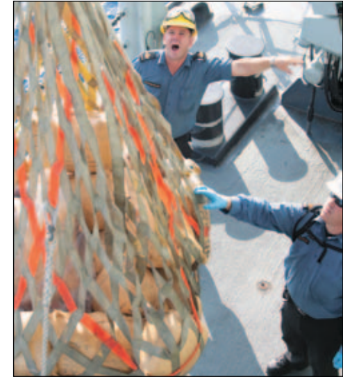
Members of Regina transfer a load of seized hashish from a Rigid Hulled Inflatable Boat to the ship.