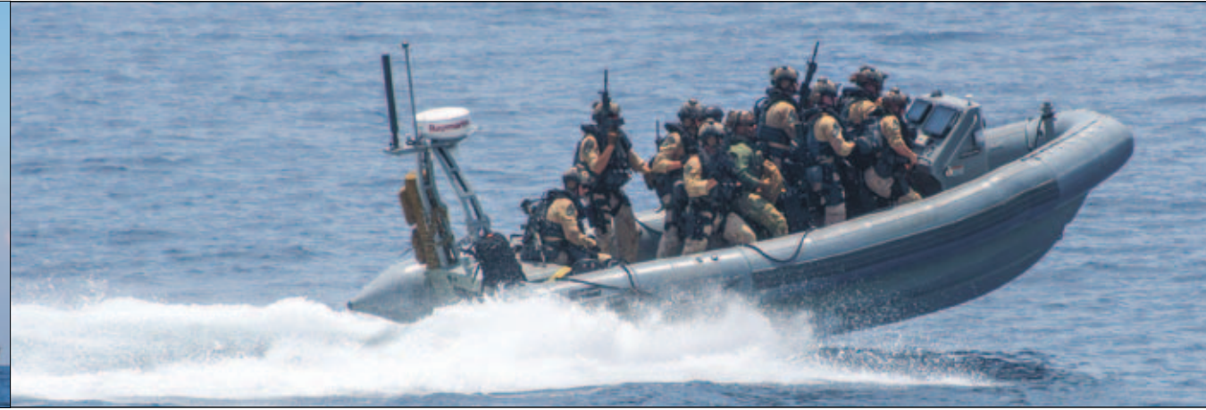
Regina's Naval Tactical Operations Group races to a dhow during Operation Artemis.