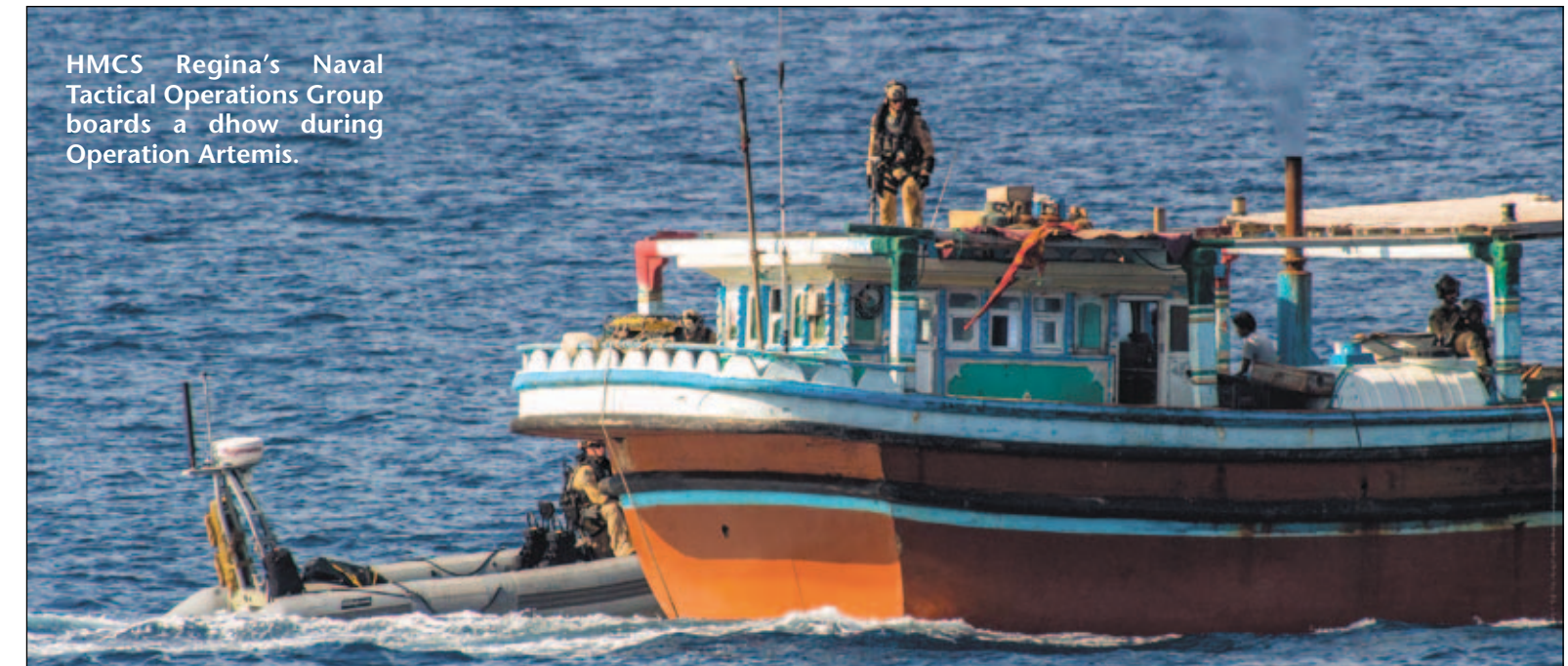
HMCS Regina's Naval Tactical Operations Group boards a dhow during Operation Artemis.