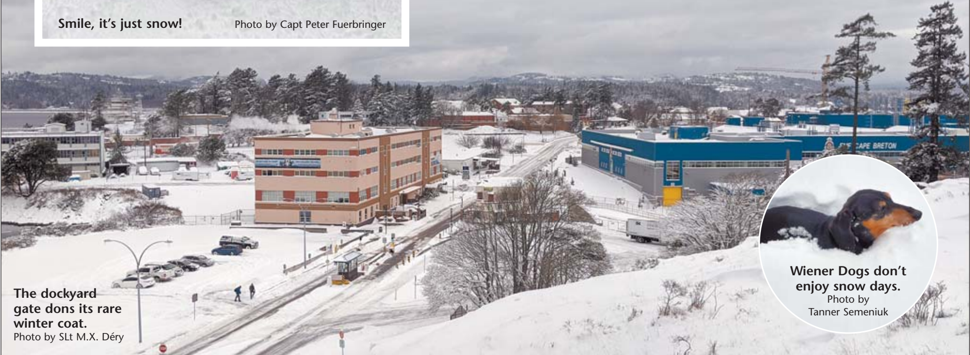
The dockyard gate dons its rare winter coat.