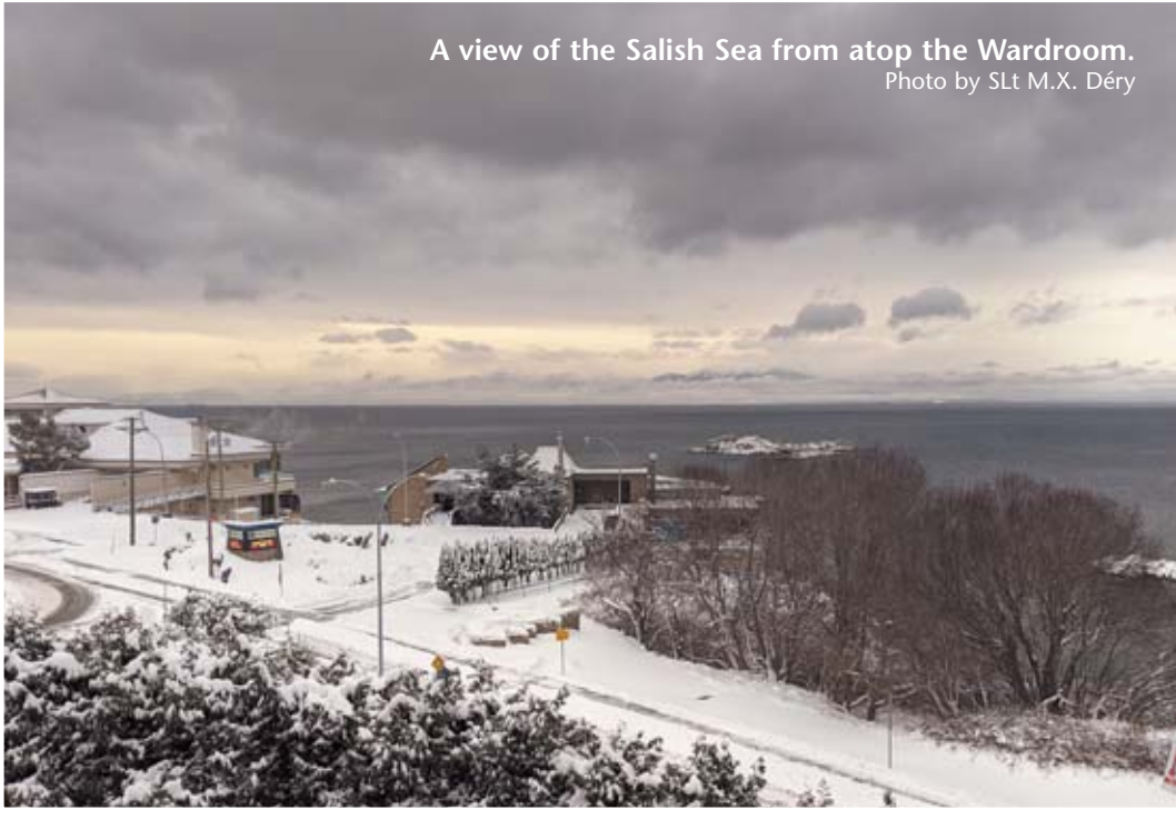
A view of the Salish Sea from atop the Wardroom.