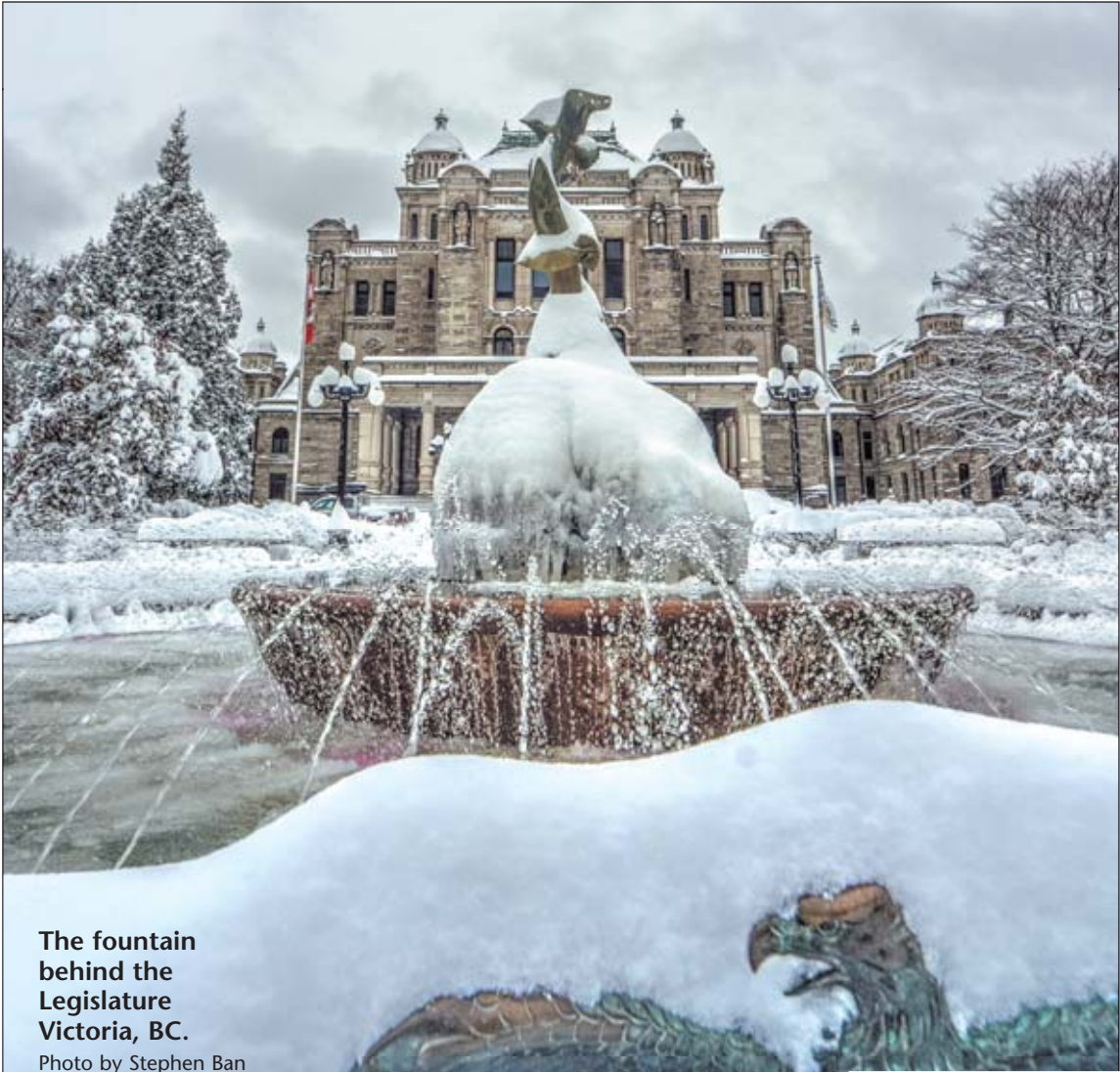
The fountain behind the Legislature Victoria, BC.