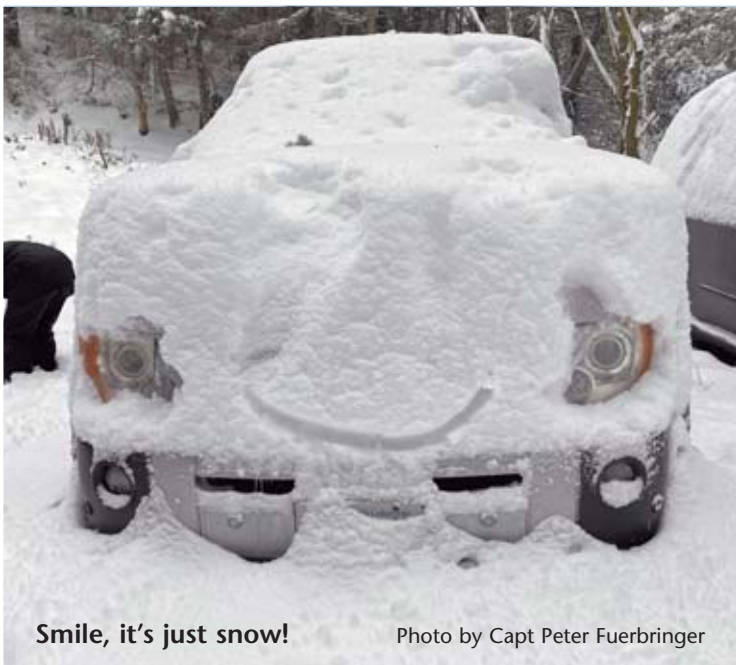
Smile, it's just snow!