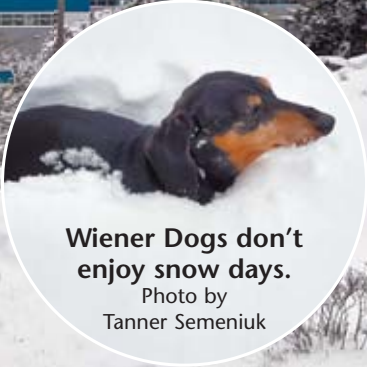
Wiener Dogs don't enjoy snow days.