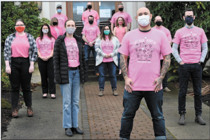
Base Executive Group show their support.

This Wednesday, wear pink to recognize your support of anti-bullying. The theme for Pink Shirt Day is Lift Each Other Up and emphasizes the importance of acceptance, respect, and inclusion for everyone. Join the Defence Team in celebrating Pink Shirt Day and help foster a culture on diversity, inclusion, and kindness by wearing pink. For more information on the Pink Shirt Day campaign, visit www.pinkshirtday.ca Official Pink Shirt Day t-shirts can be purchased at London Drugs, or you can wear a pink shirt you already have, or one from a previous year.