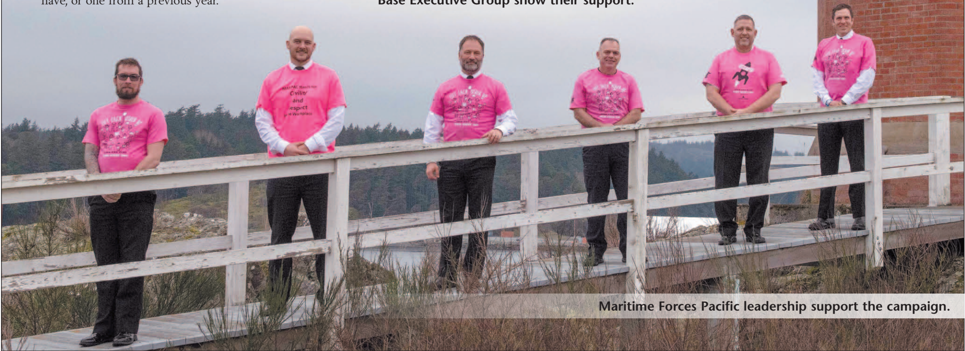
Maritime Forces Pacific leadership support the campaign.