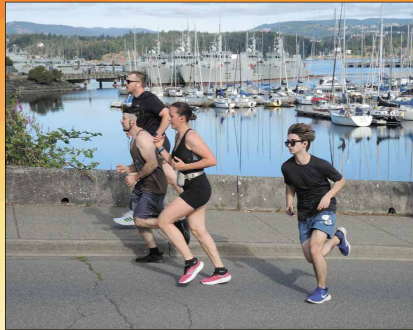
Runners vie for position as they near the halfway point.