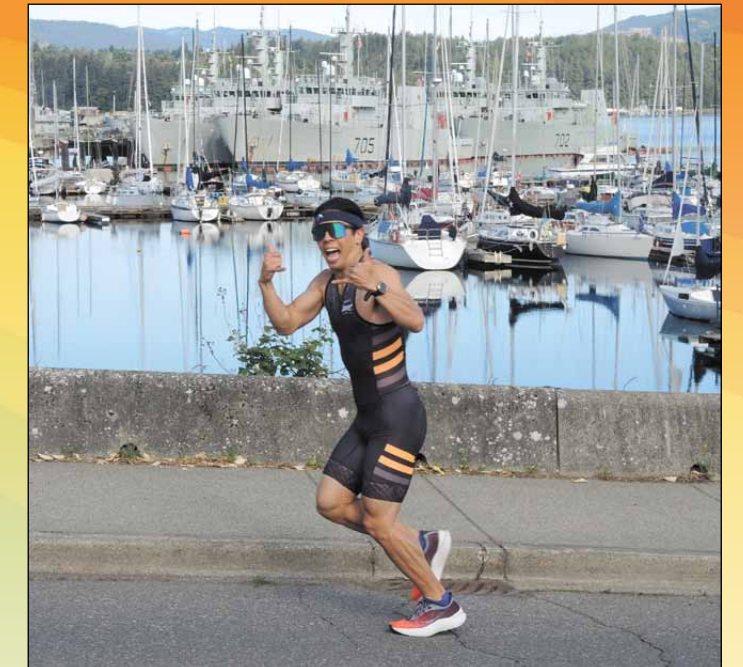
A runner gives the all-thumbs-up sign.