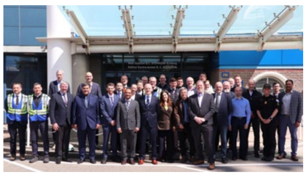
Naval architects, marine and electrical engineers, and scientists from 15 countries toured Fleet Maintenance Facility Cape Breton on May 28-29.