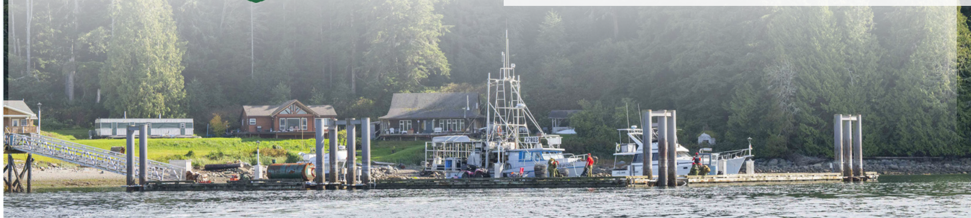
Tsat sishuk womi Village during Exercise SEA RANGER on Sept. 25.