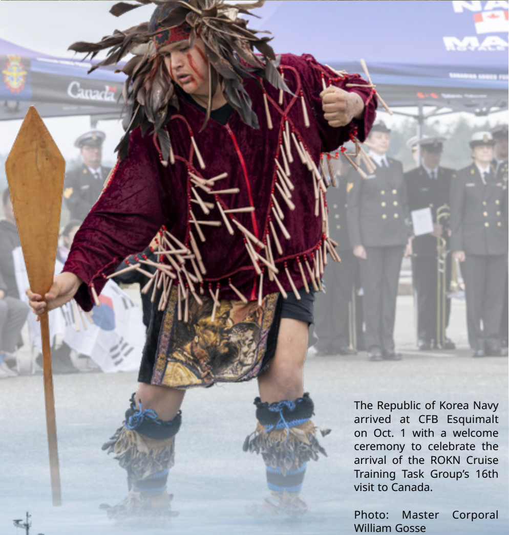
The Republic of Korea Navy arrived at CFB Esquimalt on Oct. 1 with a welcome ceremony to celebrate the arrival of the ROKN Cruise Training Task Group's 16th visit to Canada.