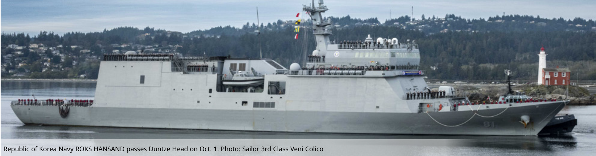
Republic of Korea Navy ROKS HANSAND passes Duntze Head on Oct. 1.