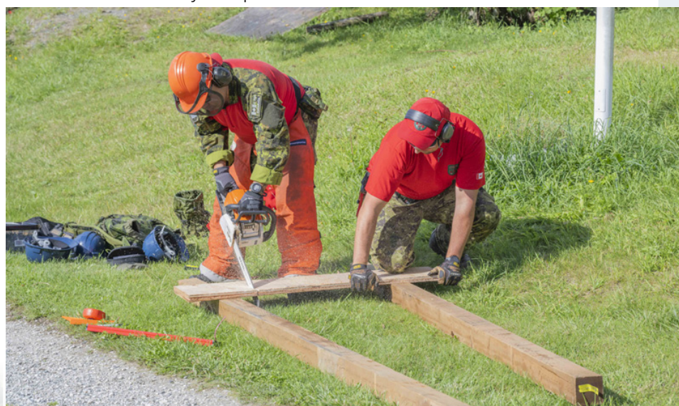
Members of 4 Canadian Ranger Patrol Group cut wood pieces for shoring during Exercise SEA RANGER on Sept. 25.