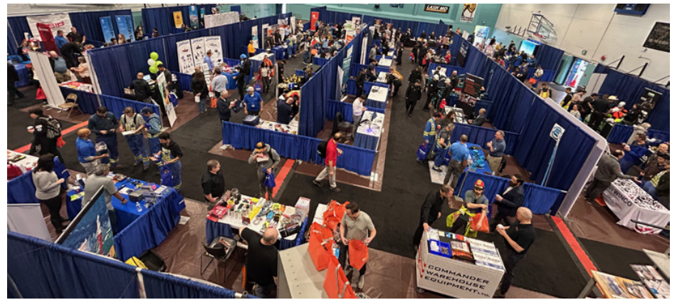
The Ship-to-Shore Industrial Tradeshow brought in vendors from across the country to showcase their products and services on Oct. 8 at the Naden Athletic Centre.

The Lookout Newspaper's Ship-to-Shore Industrial Tradeshow showcased a successful day for all.